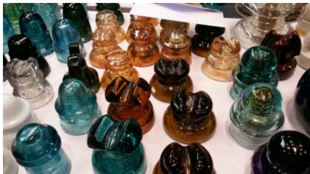
Colorful assortment on the sales table of Andy Wadysz.