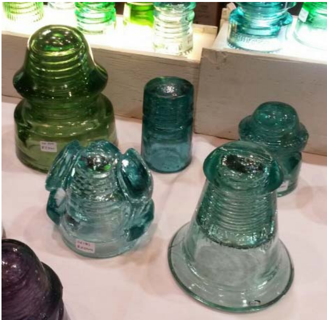
Green Jumbo, Pluto, and a squat Chambers, hanging out with “low dollar” insulators - E.C. & M and a Chicago diamond groove. A small portion of the nice glass on this table.