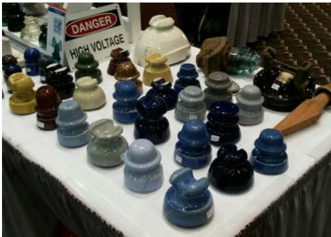
Plenty of porcelain color too. Al and Carol Fix’s table below.